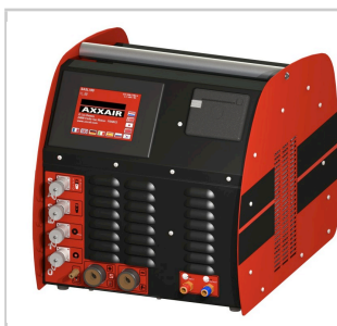
Driven by AXXAIR power source ( cf compatibility table )