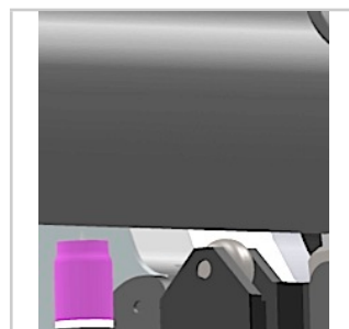
Mechanical profile guide: constant arc voltage