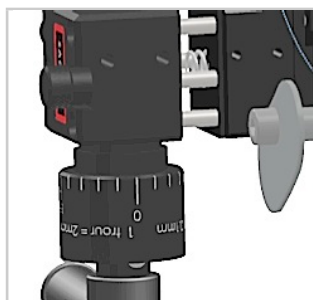
Radial adjustment for precise positioning